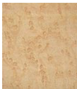
Maple Birdseye Heavy