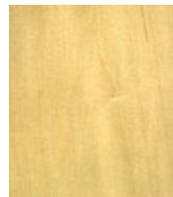
Maple Flat Cut