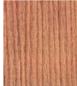
Oak Red Rift Cut