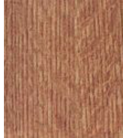
Oak Red Quarter Cut