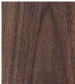
Walnut Flat Cut