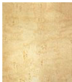
Maple Birdseye Medium