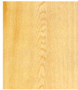
Cedar Yellow Western