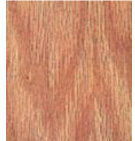
Oak Red Rotary Cut