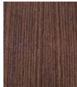
Walnut Quartered Cut