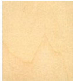
Maple Rotary Cut