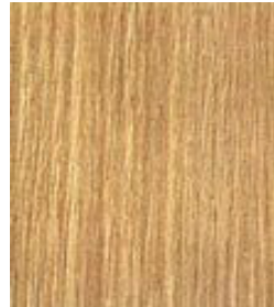
Oak White Rift Cut