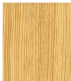
Hemlock Vertical Grain