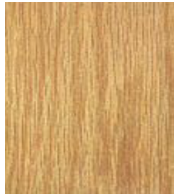
Oak White Flat Cut