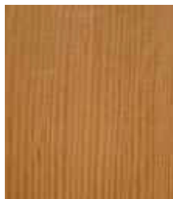
Douglas Fir Quarter Cut