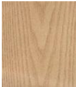
Ash Flat Cut