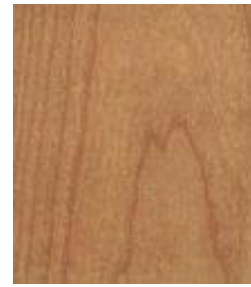
Cherry Flat Cut