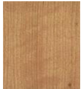
Cherry Quartered Cut