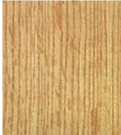
Oak White Quartered Cut