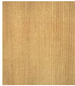
Cedar Red Western