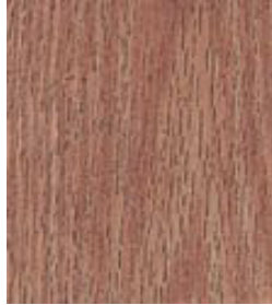
Oak Red Flat Cut