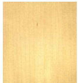
Maple Quartered Cut