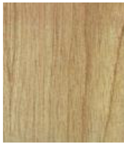
Butternut White Walnut