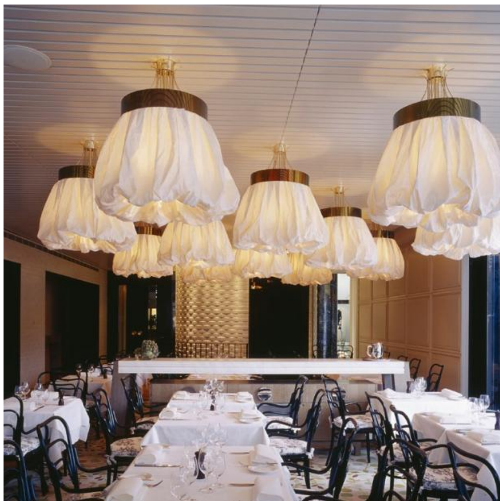
1_ Luxurious dining environment 2_ Refined function styling

situation: Chic restaurant for the renowned French chef, Guillaume Brahimi, in an exclusive Melbourne dining precinct. solution: French provincial styling was achieved with acoustic control via the installation of Atkar's Au.diSlat ceiling solution. Integral seamless jointing and concealed mounting together with precision colour matching in a high gloss finish satisfied the demands of Hecker Phelan & Guthrie's brief. Custom design of the panels allowed for continuous flow from walls into the feature stairwell with perfectly integrated lighting fixtures. Delivering beyond expectations, Atkar provided bulkheads and blind pelmets matched to the Au.diSlat system. View the Au.diSlat gallery at www.atkar.com.au/as